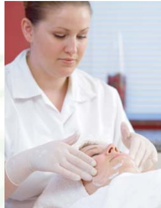
1. Skin is thoroughly cleansed.

AGERA® Rx pigmentation control peels penetrate the skin's pigment cells to gently and effectively reduce the appearance of unwanted discolouration for a more even skin tone.