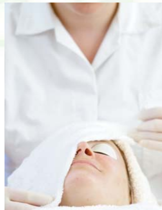
5. A layer of wet gauze is placed over the skin.