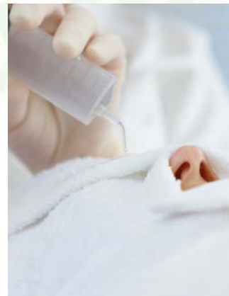
6. The peel is activated by the application of cold water.