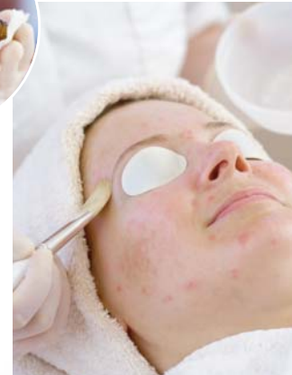
3. Peel is applied evenly with a brush.