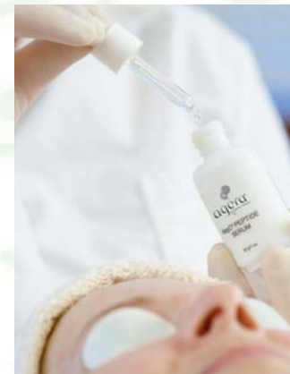
7. Gauze is removed and MagC® Peptide antioxidant serum is applied.